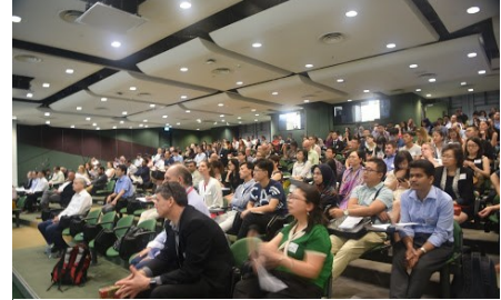
Attendees listening to a plenary talk

The regional chapters of the Controlled Release Society (CRS) and Controlled Release and Encapsulation Network (CoRE-Net) co-organised the first Controlled Release Asia meeting at Biopolis in Singapore. The conference was held over two days (24-25 September 2018) and aimed to bring to together controlled release and delivery scientists across the various fields of delivery science and technology. This meeting was attended by over 150 delegates from academic and industrial institutions.