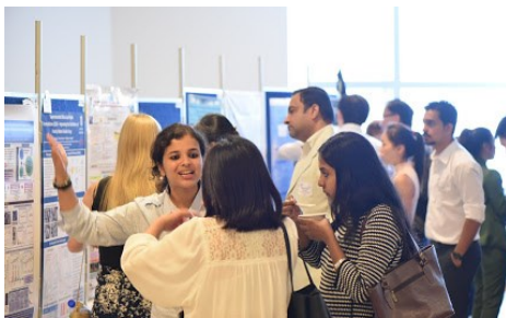
Attendees having a discussion during the tea break