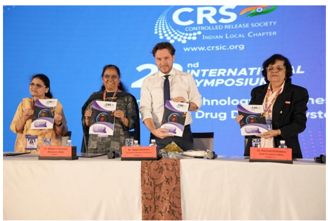
Release of CRSIC Newsletter