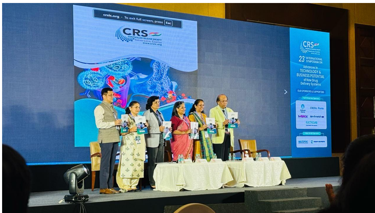
Release of CRSIC Newsletter